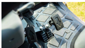
4. Responsive forward/reverse HST (5520CH)