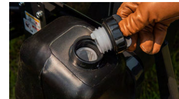
5. High-capacity fuel tank