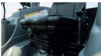
2. Comfortable suspension seat