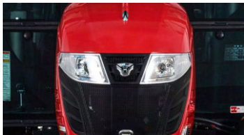
1. Hood design