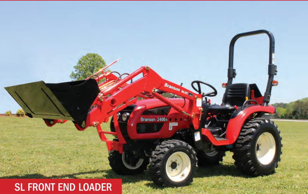
SL FRONT END LOADER