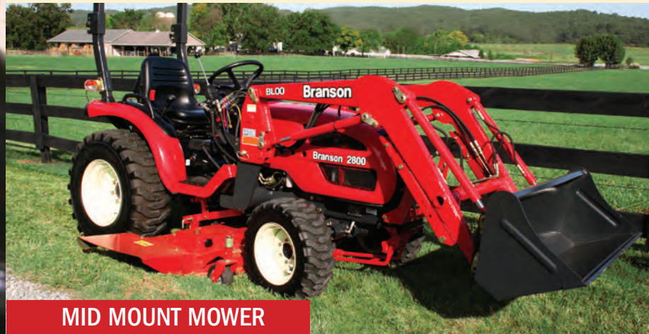
MID MOUNT MOWER